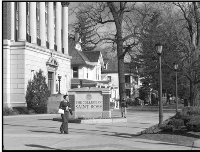
A town-gown neighborhood on Madison Avenue

The Homeownership Assistance Program is a feature of the city's Education Zone, a strategy to pursue opportunities