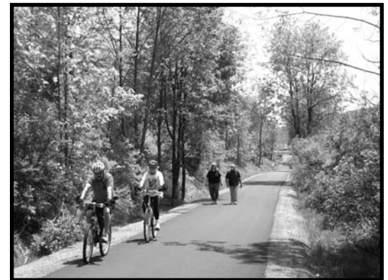
Harlem Valley Rail Trail

As part of the program, Parks & Trails New York sends out a free bi-monthly electronic newsletter with up-to-date information on ways to improve parks and